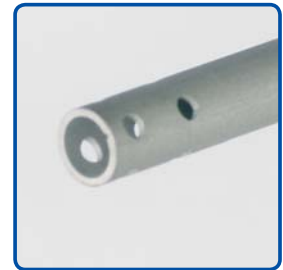
5mm Probe tip